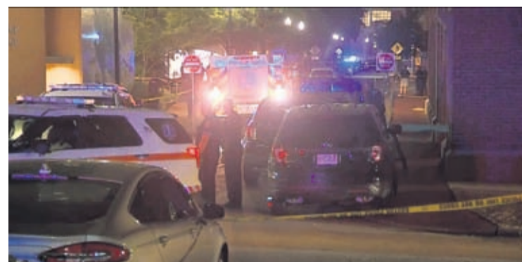
Police and emergency personnel respond the scene of an explosion in Boston, Tuesday, Sept. 13, 2022.